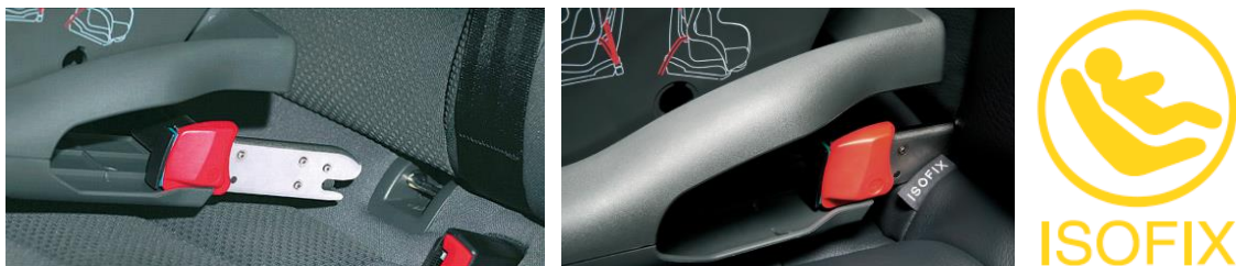
Figure 2 The ISOFIX anchoring system.

The ISOFIX system can only be used in cars equipped with an ISOFIX anchorage system for which the technical provisions are determined in UN Regulation No. 145. Under Regulation (EC) No 661/2009 such a system is made mandatory in all new vehicles in the European Union since 1 November 2014, but many older cars are also equipped with it.