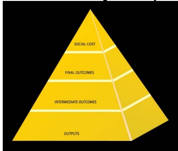
New Zealand's target hierarchy

average mean speed or increases in seat belt use. Some countries set output targets for their institutional service delivery e.g. number of breath tests required to be administered annually by the police. The New Zealand targets illustrates some of the different types of targets which can be set, although this comprehensive target hierarchy is not yet in use in European countries.