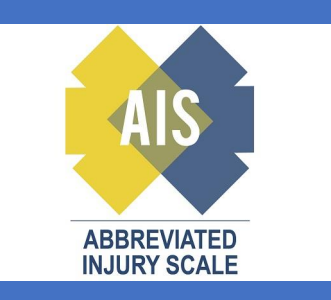
Sochor & Heltzel, 2015