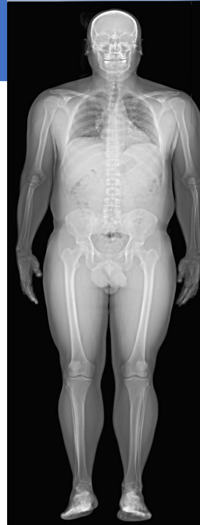
Sochor & Heltzel, 2015