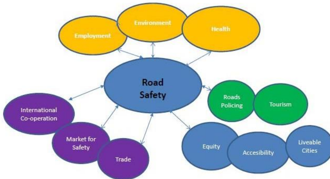
Figure 1: Integration of Road Safety into Different Policy Areas.

The integration of road safety into other policy areas can bring many benefits. Joint objectives can be elaborated through co-operation between different areas of work in the public and private realm. This can be of large benefit to reducing risk on Europe's roads.