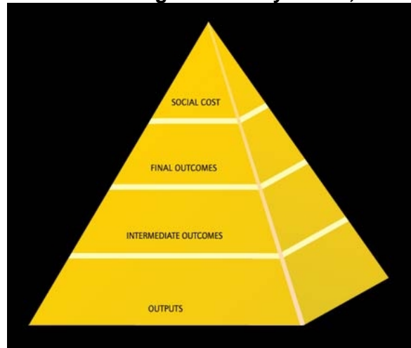
New Zealand’s target hierarchy LTSA, 2000 [40]

Good practice countries set quantitative outcome and intermediate outcome targets to achieve their desired results focus. They can also set related quantitative output targets in line with the targeted outcomes as in the New Zealand example.