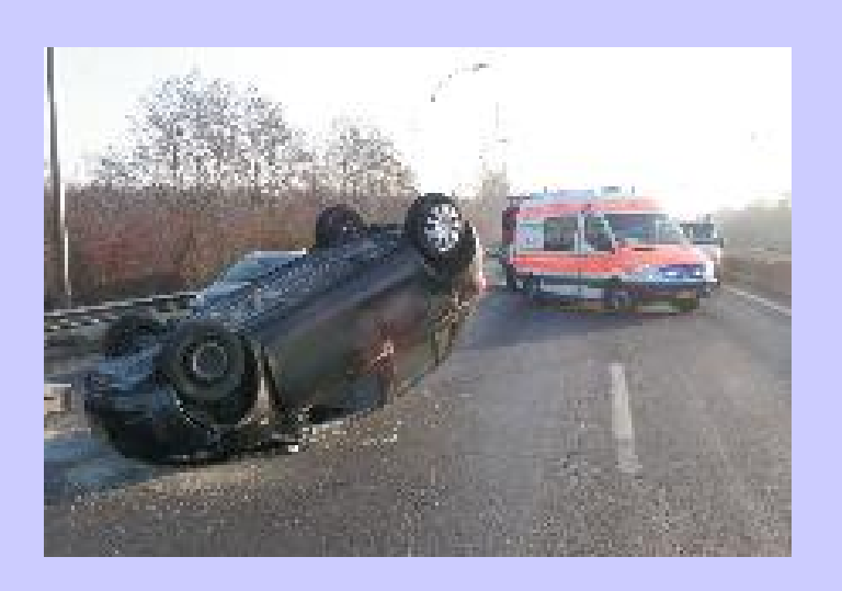
FEVR J.Mersch Brussels 8.3.2013