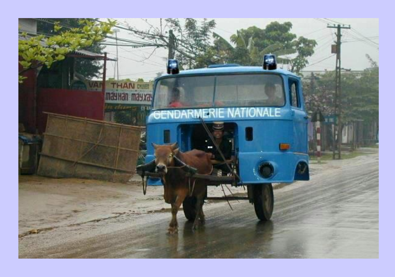
FEVR J.Mersch Brussels 8.3.2013