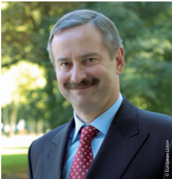
Siim Kallas, Vice-President, EU commissioner for transport

On 10 February the new Commission took office. With it, the new Commission brought several big changes: new Directorate-Generals and divisions of old ones. DG Transport and Energy is one of the DGs affected. As from 17 February 2010, DG TREN has been split into two separate entities: DG Mobility and Transport and DG Energy. DG Mobility and Transport is looking forward to working in close cooperation with the new Commissioner in charge of the Transport policy, Mr Siim Kallas.