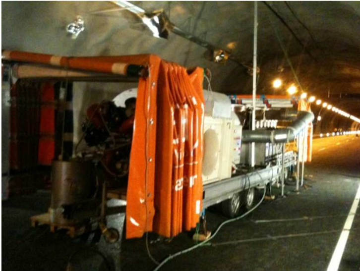
Mont-grès Tunnel Nov 2011