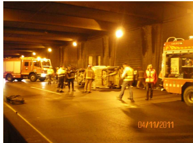
Tiana Tunnel Nov 2011