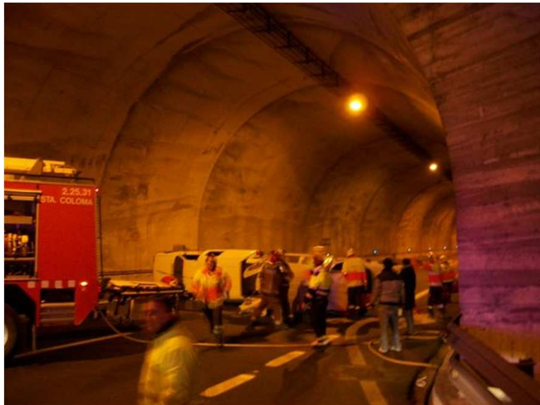
Mont-ros Tunnel Nov 2010