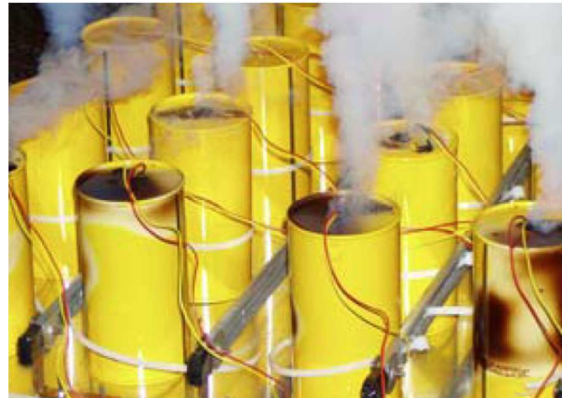
Bruc Tunnel Jul 2005