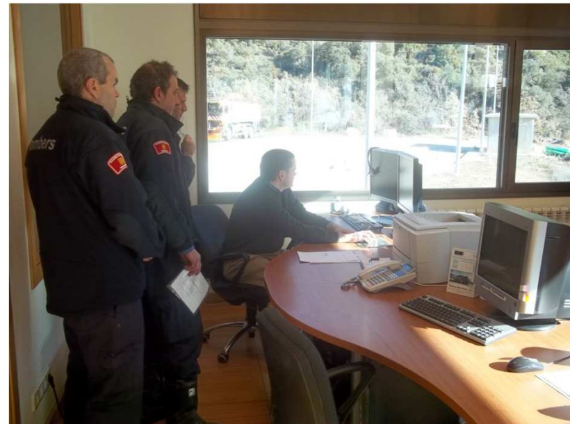
Erinyà, St Pere, Argenteria Tunnels (2,8km) Nov 2010