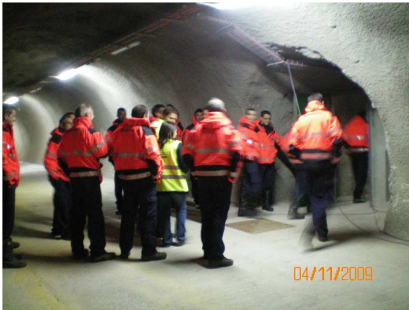
Mont-ros and Collabós Tunnels. 3,6 km Nov 2009