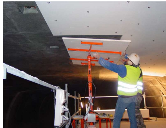
Bruc Tunnel Jan 2008